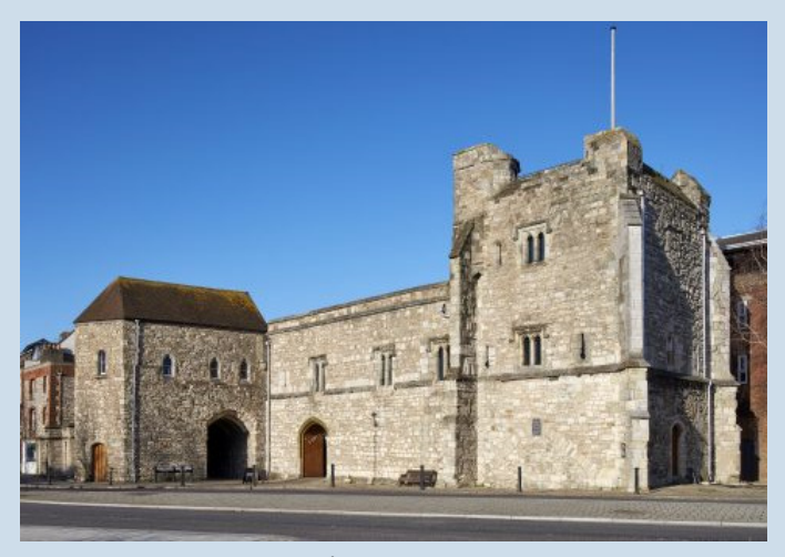
God's House Tower

In the18th century the medieval God's House Tower and gateway had been transformed into the town's main prison. One of the punishments meted out to prisoners found guilty of certain crimes was to transport them to the colonies in America. Prisoners were routinely sent there as punishment and to help the development of the colonies through their labour.