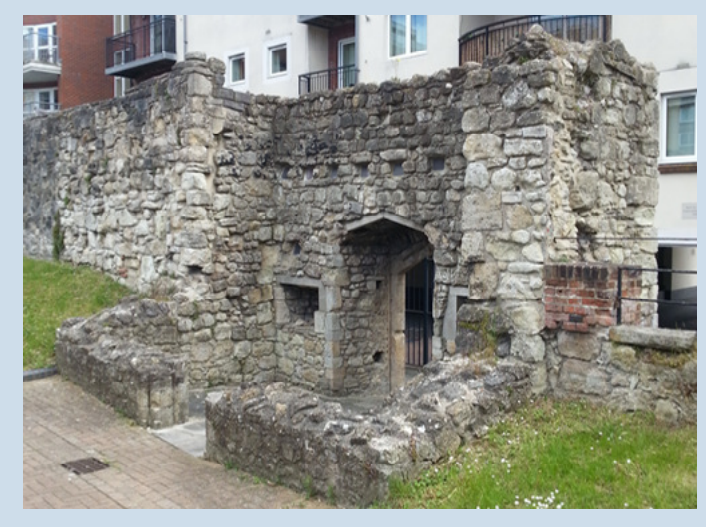
Site of Friary and Sugar House

included coffee houses, circulating libraries and assembly rooms where drinking, tea, chocolate and coffee was the height of fashion.