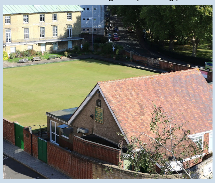
The 'Ditches' Old Canal Walk

The Ditches was so named as it was where the medieval town moat ran: from God's House, up the east side of the town, and around to the Bargate. By the end of the 18th century, the old town moat was repurposed as part of the Southampton to Salisbury canal. By the dawn of the 19th century, Southampton was about to return to being a busy working port.